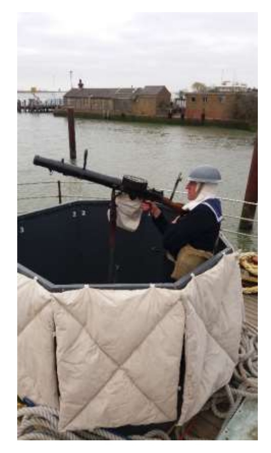
Above, left and right: Grey Funnel Line re-enactors